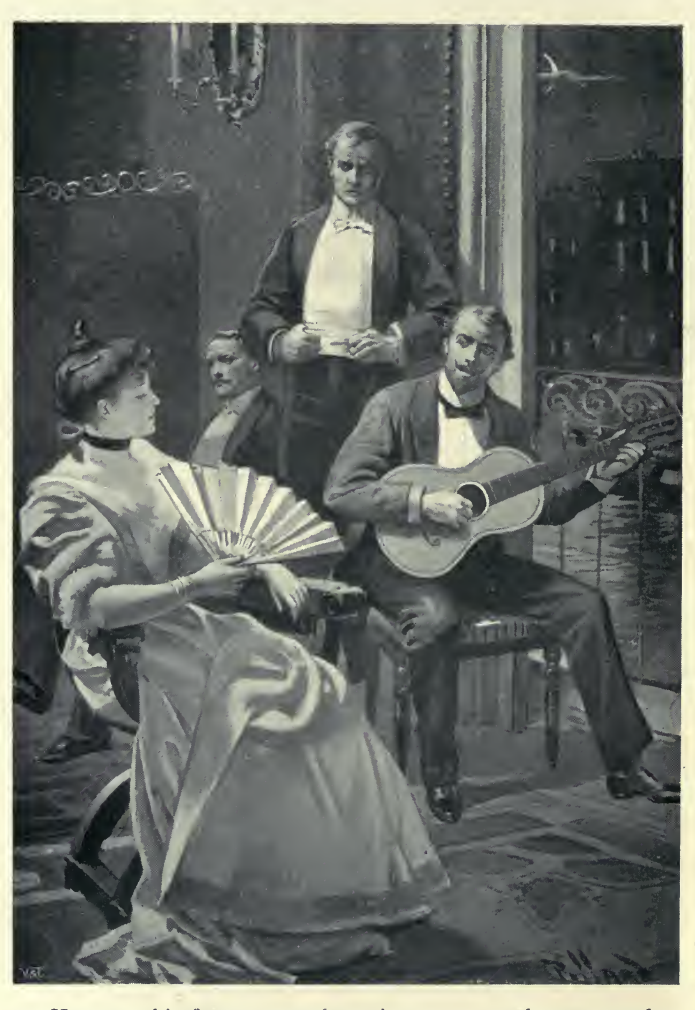
"He swept his fingers over the strings . . . . and commenced to sing." (Page 140.)